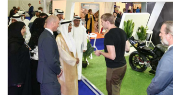
At the Gulf Traffic 2016 at Dubai World Trade Centre.

By staff reporter Published Date: November 13, 2016